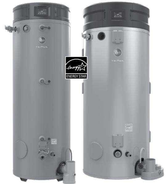
Triton SS 80 & 100-Gallon

**2.4 GHz WiFi broadband Internet connection required.