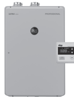
CRUTGH-95DVLN-2 Indoor Direct Vent