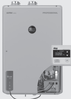
CRUTGH-95DVLN-2 Indoor Direct Vent with EcoNet® Kit 11,000-199,900 BTU/h Only

Shares all efficiency, performance, technology, warranty and safety values as standard models, with added WiFi capability.