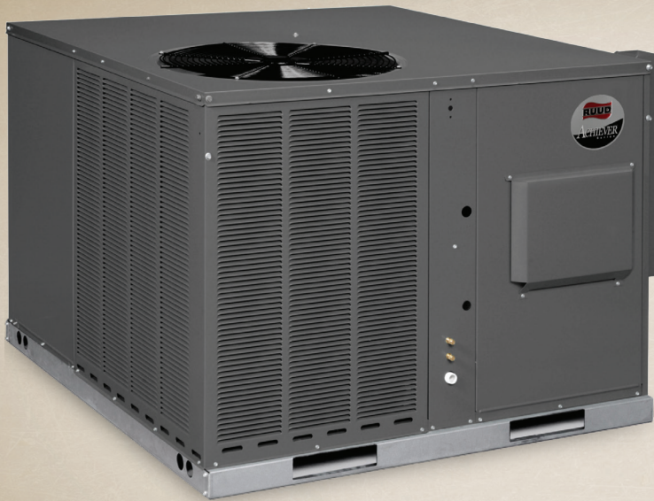
Achiever® Series Gas Electric Units RGEA14 / RGEA15 / RGEA16

We took it a step further and delivered PlusOne® advantages—unique Ruud innovations designed to make your job easier while providing homeowners with the ultimate home comfort experience.