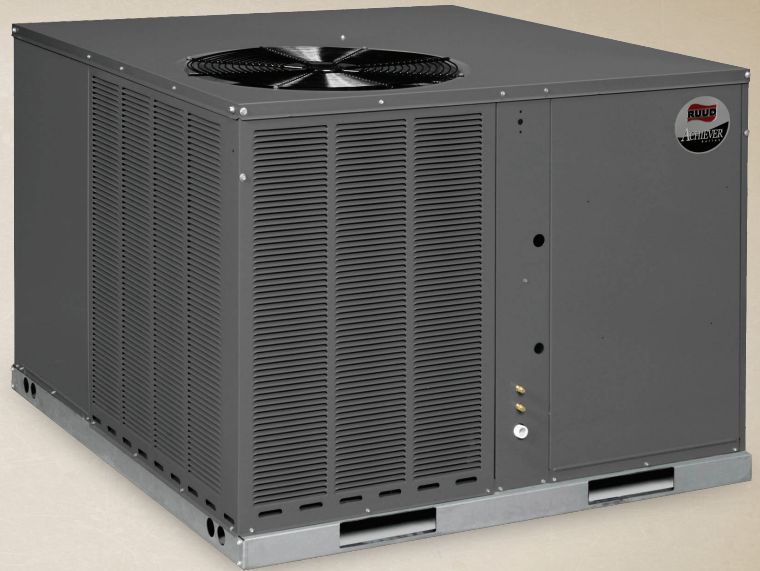
Achiever® Series Air Conditioners RACA14 / RACA15