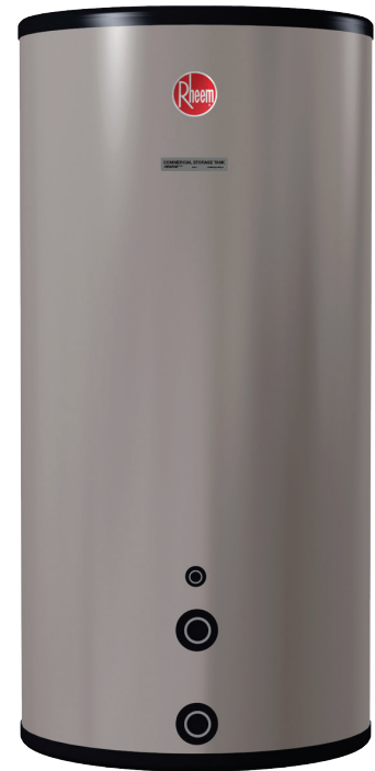
Rheem Commercial Storage Tanks 80, 115 and 175-Gallon Capacities