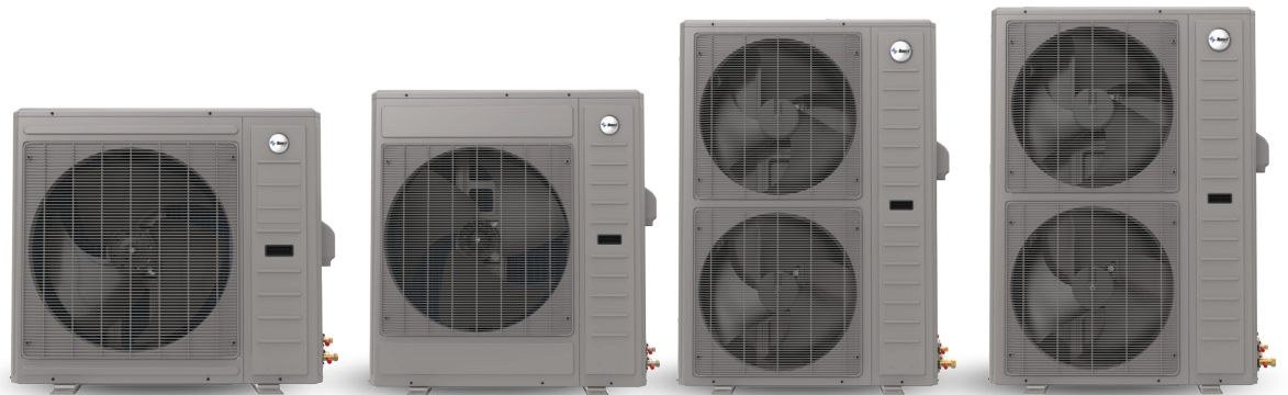
2 ton RD18AY24AJVCA