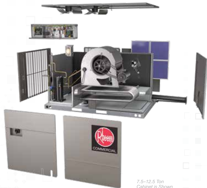
7.5-12.5 Ton Cabinet is Shown

From new construction to replacement projects and more, the new Rheem® Commercial Renaissance™ Line offers a breadth of commercial heating and cooling products that meet all design and application requirements. Whether your business is retail, hotels, restaurants, offices, schools, senior care or gyms, you'll have the ability to connect a new, customized Renaissance unit quickly and efficiently, providing comfort and peace-of-mind.