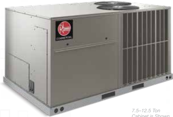
7.5-12.5 Ton Cabinet is Shown

:: customized solutions to help grow your business.