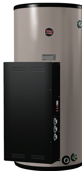
Ruud Heavy Duty 50, 85, 120 & 175-Gallon Capacities ASME Construction Option 3-Year Limited Warranty Electric