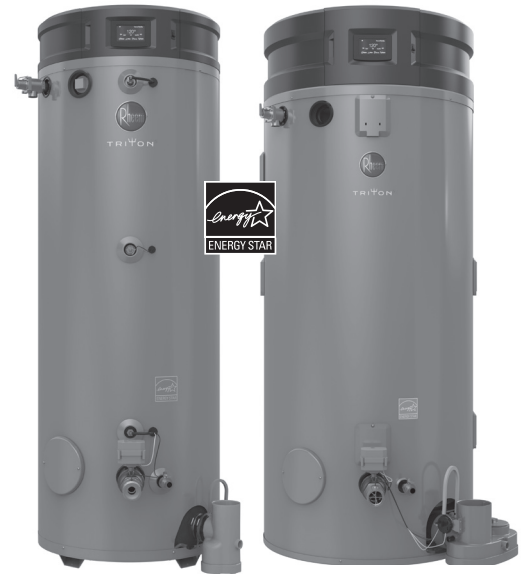
Triton SS 80 & 100-Gallon