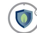
PlusOne® SmartShield™ Coil System

Renaissance products offer up to 15.0 IEER / 11.0 EER in 3-6 Ton, 7.5-12.5 Ton and 15-25 Ton capacities. Innovative features like our exclusive PlusOne® HumidiDry™ and patented VelociFin™ heat exchanger 2 enhance overall and part-load performance.