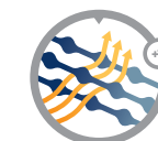
PlusOne® VelociFin™ Heat Exchanger

Contractors spend up to 100 minutes less time performing industry-standard service & preventive maintenance, adding up to substantial savings 3 .