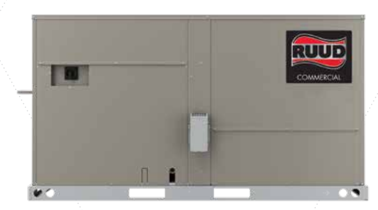
7.5-12.5 Ton Cabinet is Shown

Redesigned for today's demanding commercial applications, the Renaissance<sup>™</sup> Line is packed with smart thinking—like high-quality critical components, lean manufacturing processes and robust design features—including the strengthened, solid, single-piece top; durable panels; and Scroll<sup>™</sup> compressor technology. Ruud<sup>®</sup> offers innovative engineering that delivers easy installability, smart serviceability and industry-leading efficiencies for uptime reliability in a wide range of rooftop environments.