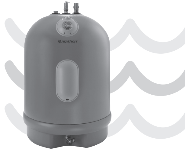
Marathon Point-of-Use 15 and 19.9-U.S. Gallon Capacities Electric

† See Warranty Certificate for complete information