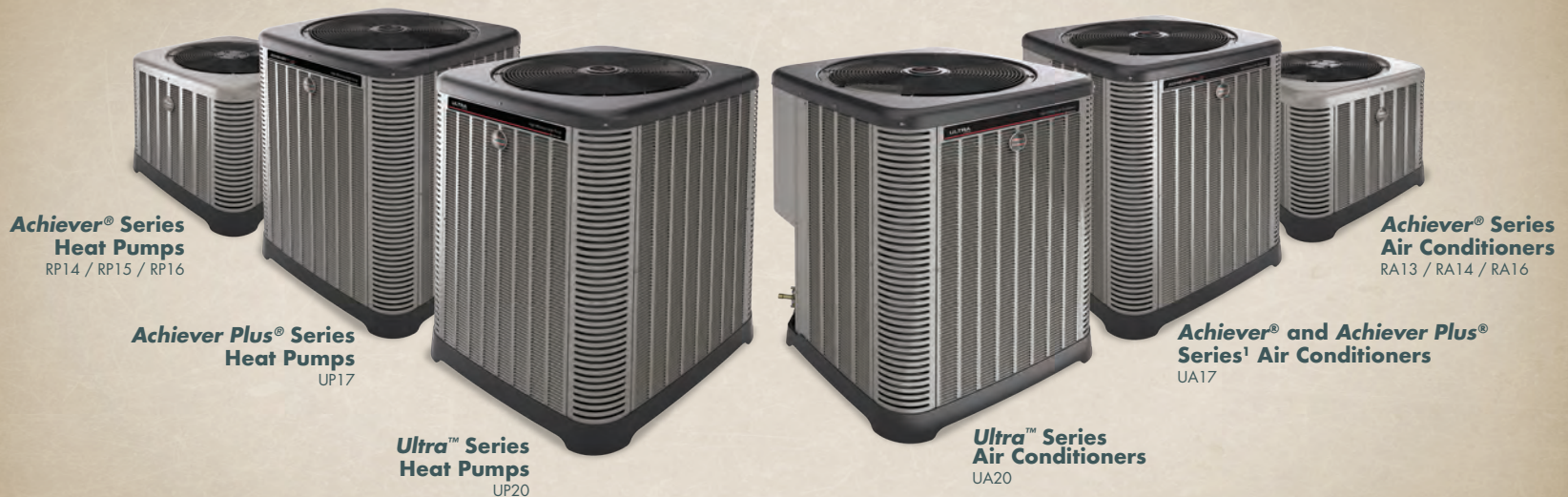
Achiever® Series Heat Pumps RP14 / RP15 / RP16

We took it a step further and delivered PlusOne® advantages—unique Ruud innovations designed to make your job easier while providing homeowners with the ultimate home comfort experience.