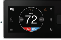
EcoNet Smart Thermostat