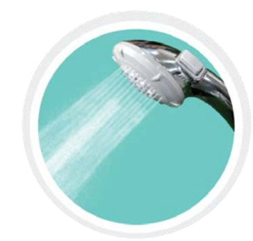
Mist & Massage Spray