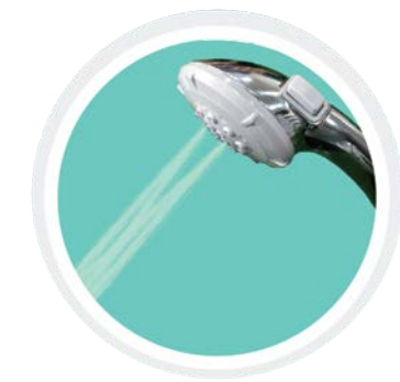
Concentrated Massage Spray