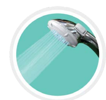
Full Massage Spray