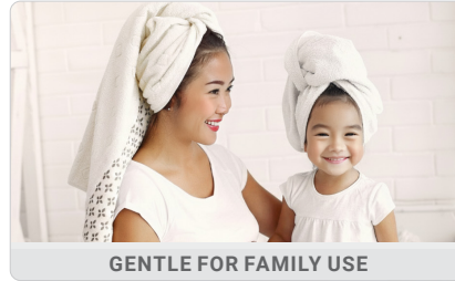
GENTLE FOR FAMILY USE