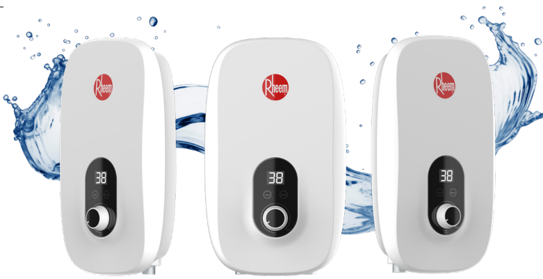
G10 SERIES ELECTRIC INSTANT WATER HEATER