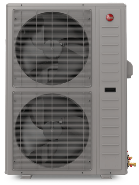
5 ton RD18AY60AJVCA