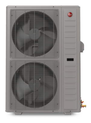
4 ton RD18AY48AJVCA