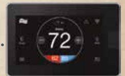
EcoNet Smart Thermostat