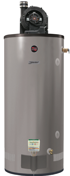
Ruud Power Vent 75-Gallon Capacity 75,100 BTU/h Natural and LP Gas

Safety and Construction | Design certified by CSA Laboratories: a) To meet all safety and construction requirements of ANSI Z21.10.1. b) As an automatic storage water heater. c) For operation of combustible floors, in alcove, and closet installations. d) For combination water heating and space heating applications. All models are North Carolina code compliant. Certified for 150 PSI maximum working pressure.