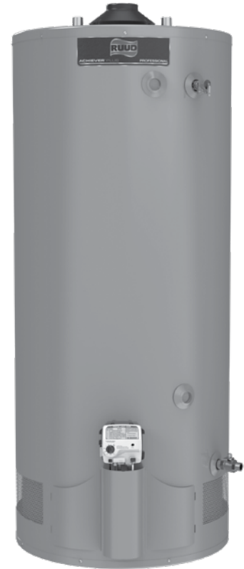
Professional Achiever Plus Heavy Duty Ultra Low NOx 75-Gallon (75,100 BTU/h) and 98-Gallon (80,000 BTU/h) Capacities Natural Gas

Safety and Construction | Design certified by CSA: For operation at 160 degrees; meets all safety and construction requirements of ANSI Z21.10.3; as an automatic storage or instantaneous water heater; as an automatic circulating tank water heater; and for operation on combustible floors and in alcove installations. All models are North Carolina Code compliant. Certified for 150 PSI maximum working pressure.