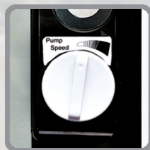
Pump Speed Control