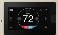
EcoNet Smart Thermostat