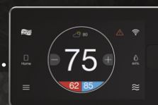
EcoNet Smart Thermostat