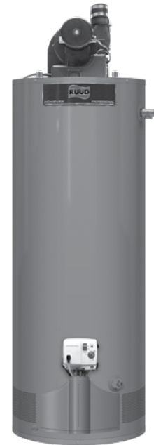
Professional Achiever Power Vent Ultra Low NOx 40 and 50-Gallon Capacities Up to 38,000 BTU/h Natural Gas

Units meet or exceed ANSI requirements and have been tested according to D.O.E. procedures. Units meet or exceed the energy efficiency requirements of NAECA, ASHRAE standard 90, ICC Code and all state energy efficiency performance criteria.