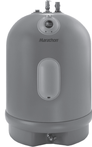
Ruud Marathon Point-of-Use 15 and 19.9-Gallon Capacities Electric

Units meet or exceed ANSI requirements and have been tested according to D.O.E. procedures. Units meet or exceed the energy efficiency requirements of NAECA, ASHRAE standard 90, ICC Code and all state energy efficiency performance criteria.