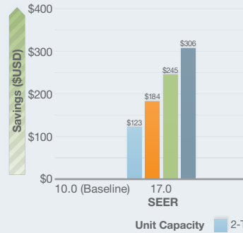
Annual Energy Cost Savings for Cooling 10.0-SEER Baseline*