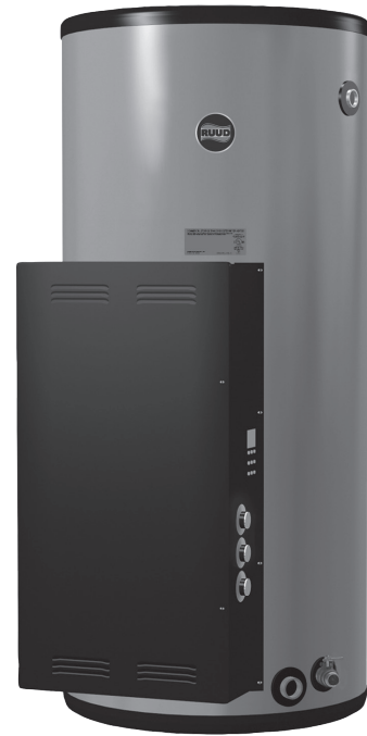
Ruud Heavy Duty 50, 85, 120 & 175-Gallon Capacities ASME Construction Option 3-Year Limited Warranty Electric

See Commercial Warranty Certificate for complete information.