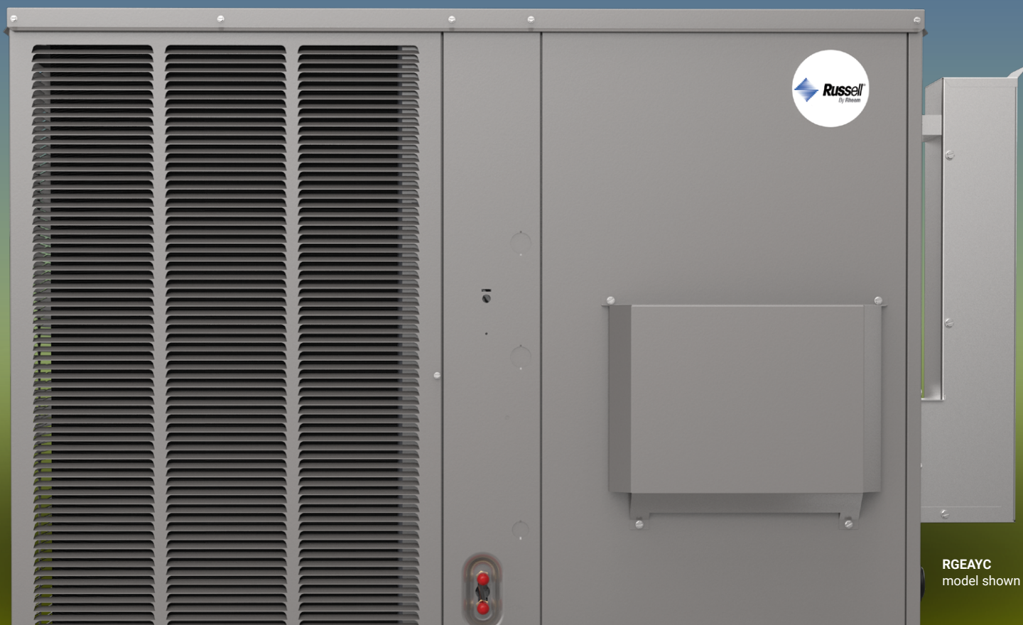
RGEAYC model shown

Earning ENERGY STAR® recognition means products meet strict energy efficiency guidelines set by the U.S. Environmental Protection Agency. ENERGY STAR certified heating and cooling equipment can enhance the comfort of your home while saving energy—which saves money on utility bills and protects our climate by reducing harmful carbon pollution and other greenhouse gases.