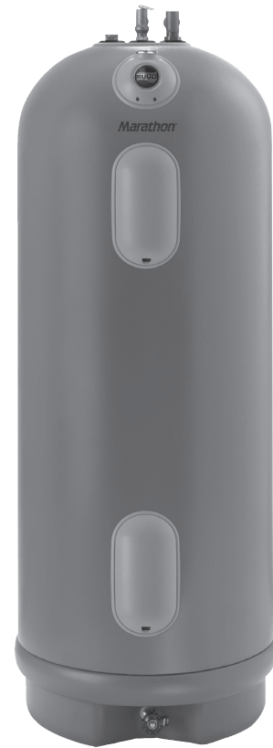
Ruud Marathon 30, 40 50, 85 and 100-Gallon Capacities 240 Volt AC/Single Phase Electric

Units meet or exceed ANSI requirements and have been tested according to D.O.E. procedures. Units meet or exceed the energy efficiency requirements of NAECA, ASHRAE standard 90, ICC Code and all state energy efficiency performance criteria.