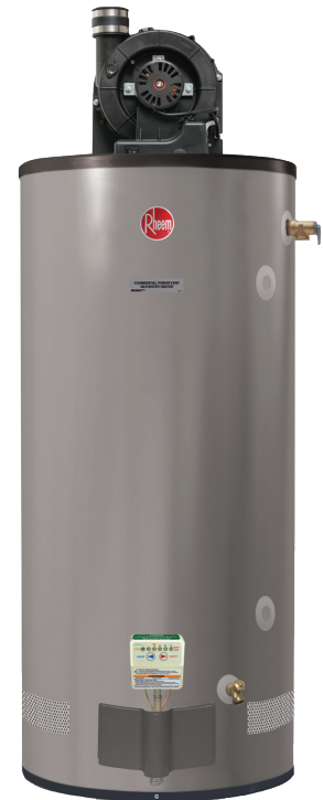
Rheem Power Vent 75-Gallon Capacity 75,100 BTU/h Natural and LP Gas

Safety and Construction | Design certified by CSA Laboratories: a) To meet all safety and construction requirements of ANSI Z21.10.1. b) As an automatic storage water heater. c) For operation of combustible floors, in alcove, and closet installations. d) For combination water heating and space heating applications. All models are North Carolina code compliant. Certified for 150 PSI maximum working pressure.