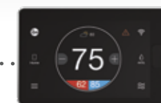
EcoNet Smart Thermostat