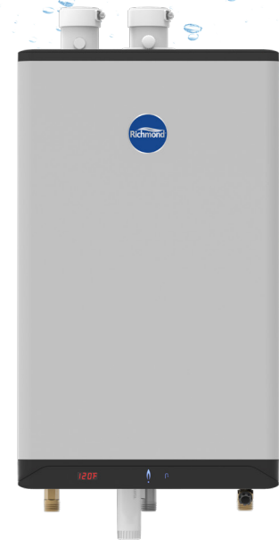
RMTGH-L199i Indoor Direct Vent 28,500-199,000 BTU/h Natural Gas/LP Convertible

1 See Warranty Certificate for complete information