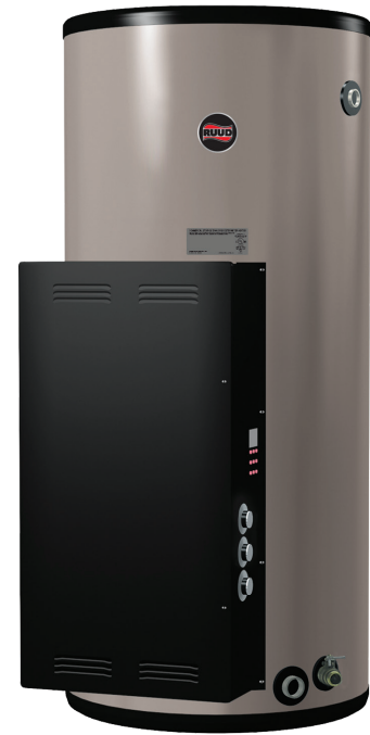
Ruud Heavy Duty 50, 85, 120 & 175-Gallon Capacities ASME Construction Option 3-Year Limited Warranty Electric