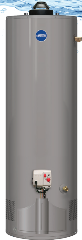
Encore Powered Damper Ultra Low NOx 40 and 50-Gallon Capacities 38,000 BTU/h Natural Gas