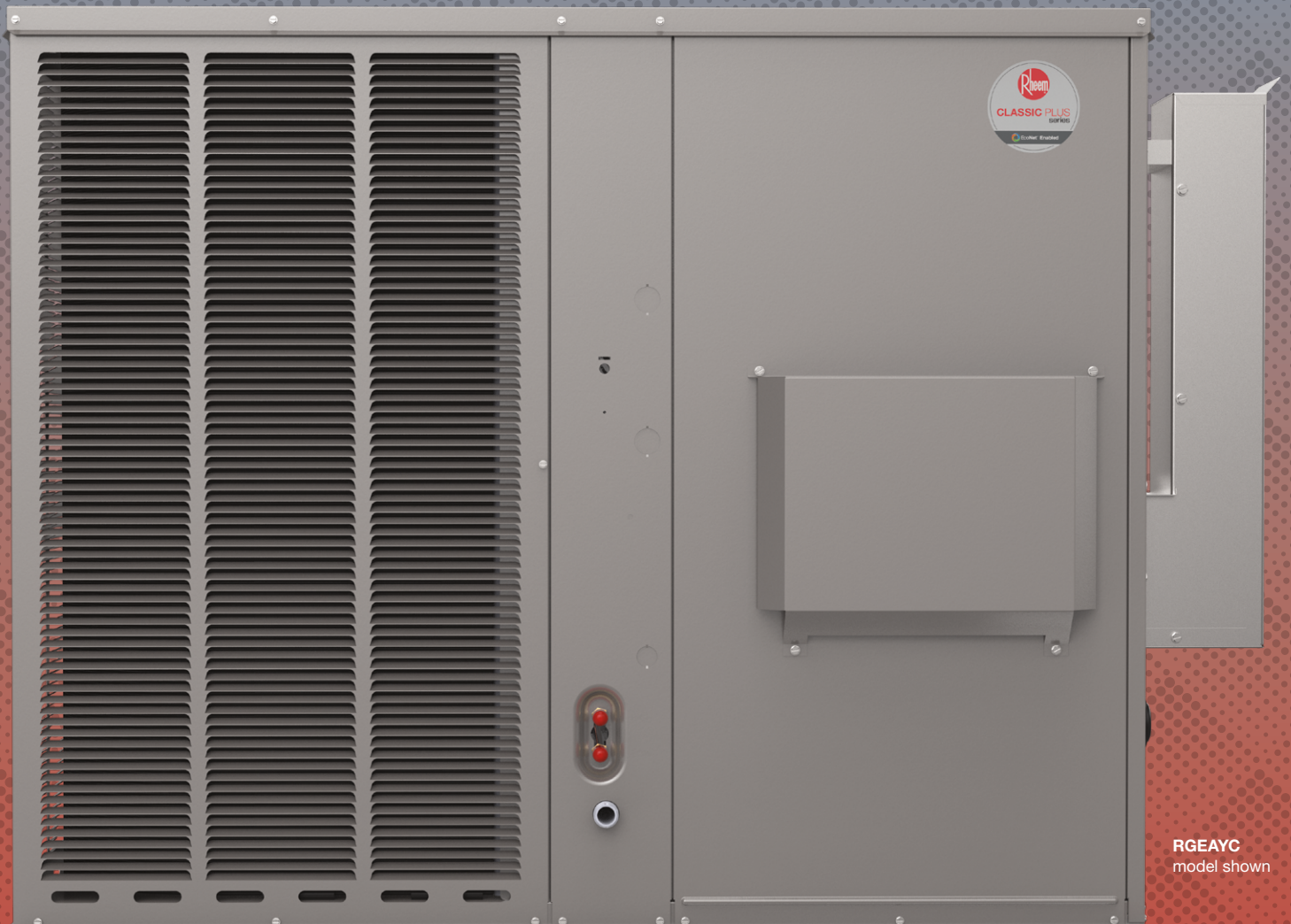
RGEAYC model shown